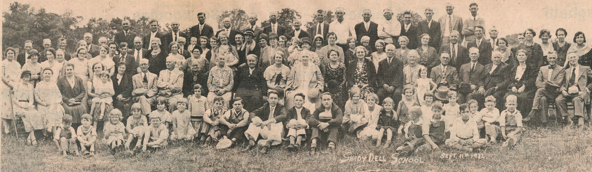
These people attended the reunion at Elk Rapids school held back on Sept. 11, 1932. This picture was given to us by