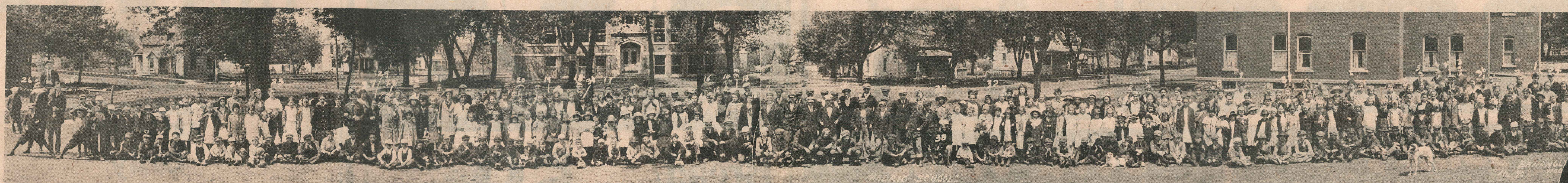
This picture shows all the students attending classes at Madrid in May of 1916. The old school building is shown in the background to the right in this photo. The present elementary-junior high building is also shown.